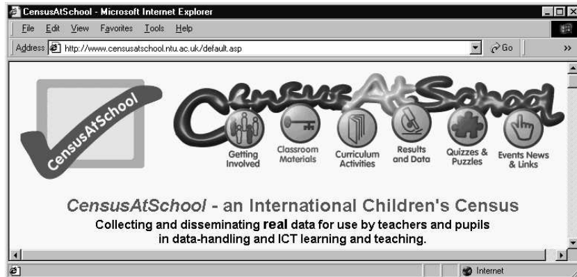
Figure 1. The UK CensusAtSchool homepage

UK National census and saw the CensusAtSchool project as a precursor to it, potentially raising its profile and encouraging a more positive image through association with a school-based event that is children-friendly and up to date.